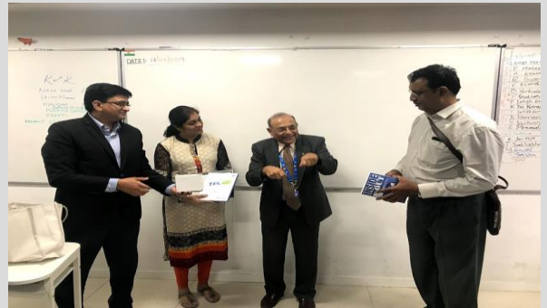
The session was excellently received and the ASSP team felicitated by the Tata Group